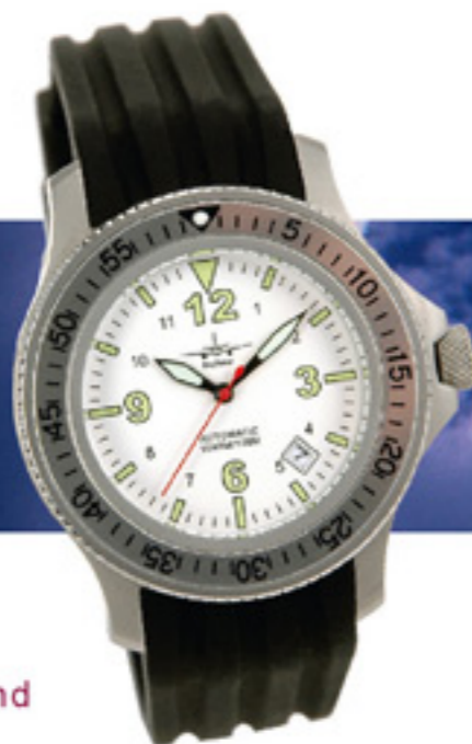
Rubber strap Kautschukband