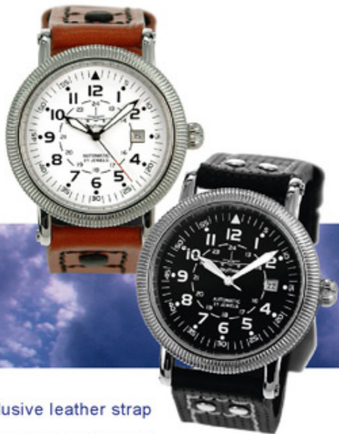
Exclusive leather strap Exklusives Lederband