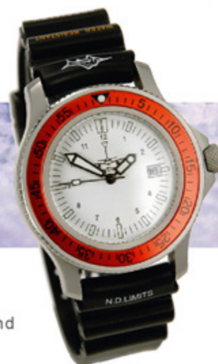
PU Diver strap PU Taucherband