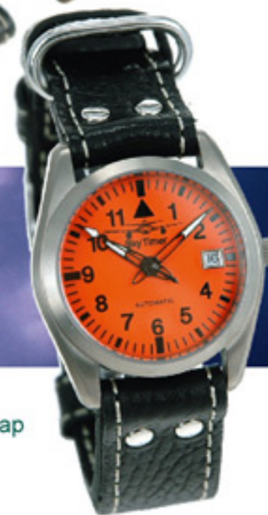
Special pilot strap Pilotenband