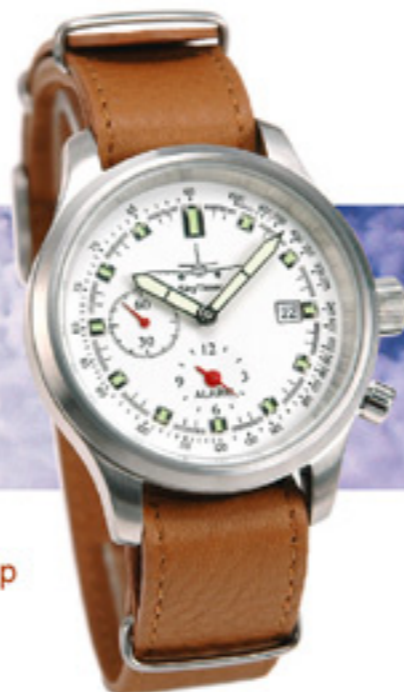
„Nato“ leather strap „Nato“ Lederband